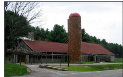
WESTERN PA CONSERVANCY MILL RUN, PENNSYLVANIA REGIONAL INTERPRETIVE CENTER AT BEAR RUN NATURE PRESERVE