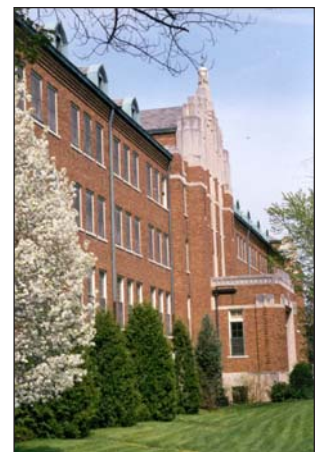
Immaculate Heart of Mary