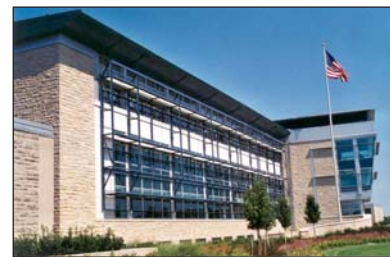
PENNSYLVANIA TURNPIKE COMMISSION HARRISBURG, PENNSYLVANIA CENTRAL ADMINISTRATION BUILDING