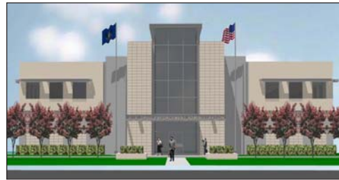
U.S. DRUG ENFORCEMENT ADMINISTRATION PITTSBURGH, PENNSYLVANIA NEW OFFICE BUILDING