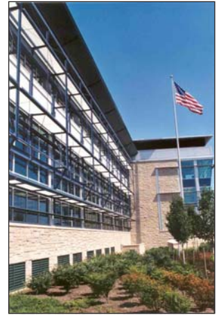
PA Turnpike Commission

H .F. Lenz Company has been providing consulting engineering services for over 60 years, offering a full range of engineering services for building systems, infrastructure, and industry. Our projects span the nation, with the heaviest concentration in the Northeast, and exceed $300 million in MEP construction annually. Each market sector – corporate, government, healthcare, education and industry – is served by a team of specialists who understand the unique needs of the clients they serve. H.F. Lenz Company has over 180 employees, including 47 professional engineers, registered in a total of 42 states and the District of Columbia. Our green building and LEED™ projects vary across our market sectors and consist of office buildings, childcare facilities, visitor centers, manufacturing facilities, and higher education facilities including both residential and classroom buildings.