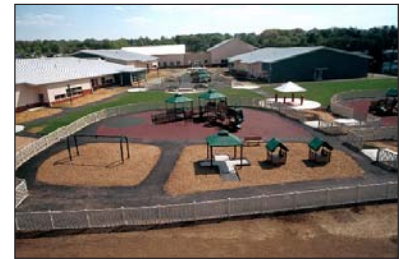
SOCIAL SECURITY ADMINISTRATION WOODLAWN, MARYLAND NEW CHILDCARE CENTER