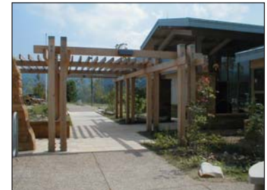
National Park Service - Sandstone