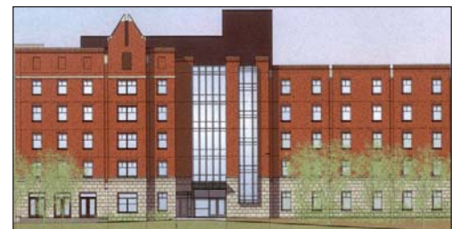
CARNEGIE MELLON UNIVERSITY PITTSBURGH, PENNSYLVANIA NEW HOUSE RESIDENCE HALL