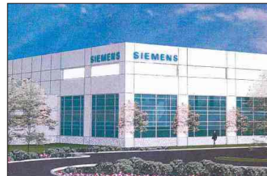
SIEMENS WESTINGHOUSE MUNHALL, PENNSYLVANIA FUEL CELL MANUFACTURING FACILITY